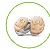
In the canal