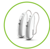
Receiver in canal