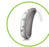
Behind the ear