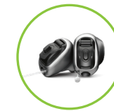
Completely in the canal